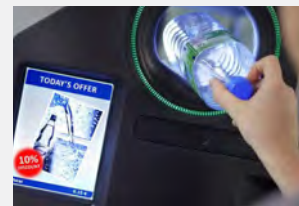
Boost sales with RVAd